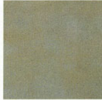
CS-11 Fern Green*