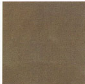
CS-11 Fern Green* over A-53 Arizona Tan