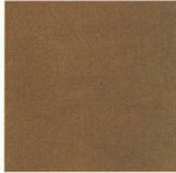
CS-12 Weathered Bronze*