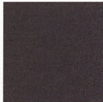
CS-14 Dark Walnut