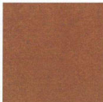
CS-2 Padre Brown over 0266 Ash White