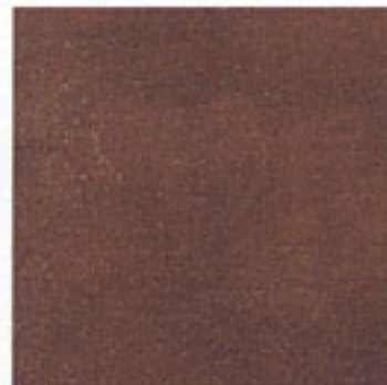
CS-2 Padre Brown