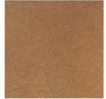
CS-15 Antique Amber