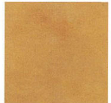
CS-15 Antique Amber over 3611 Oyster White