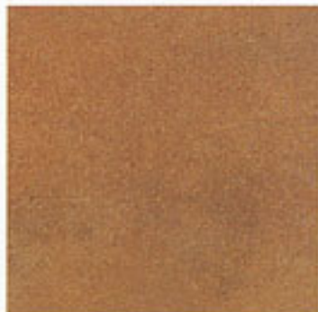
CS-12 Weathered Bronze* over A-56 Venetian Pink