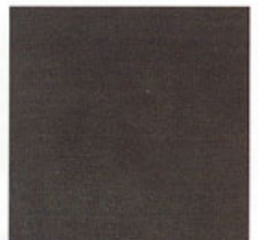
CS-1 Black over A-50 Slate Gray