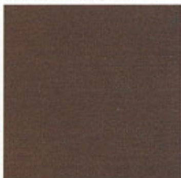
CS-16 Faded Terracotta over A-33 Classic Gray