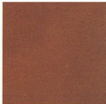
CS-16 Faded Terracotta