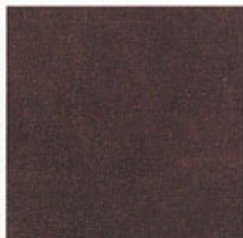
CS-14 Dark Walnut over A-26 Brick Red